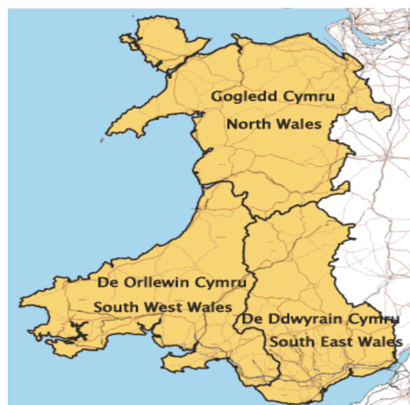
Map: Wales Regional Waste Plan Areas

The RWPs provide a statement of how they will help contribute to general waste management objectives within the Landfill Directive and the National Waste Strategy .